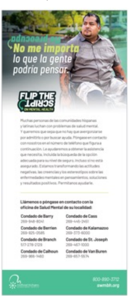
In 2025, let us talk about mental health and spread positivity. If we can lower stigma, we can create a community for all people to get the help and health they deserve.