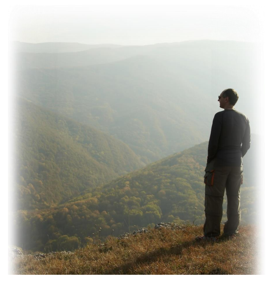
Your Friend, An adult who grew up in a family trapped by addiction

I want to tell you some things about addiction that I wish someone had told me when I was a kid. Maybe these things will help you understand a little bit better, and maybe you won't blame yourself the next time your parents drink too much or use drugs.